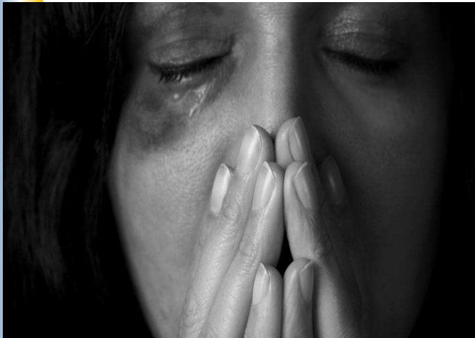
Suicide Awareness and Prevention

We also support those programs that aren't so pretty to look at! The invisible populations, the ones none of us want to see in our community.